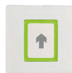
DINRTT: Push button + additional 2 relay board