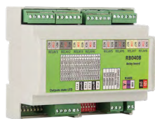
RBO408: Additional 8 relay board