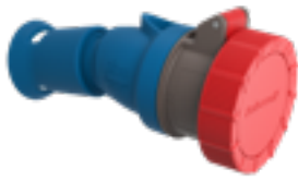
SERIE X-CEE Prese mobili diritte safety performance IP66/IP67/IP68/IP69

Prese industriali IEC 60309 safety performance